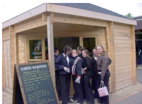
Bespoke designs to meet the needs of schools.

“They provide a real and more permanent, long-lasting, alternative to the portacabin style classrooms that many schools rely on when their admission numbers go up. And they are much more attractive and eco-friendly.”